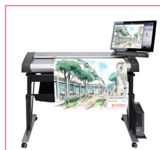
ScanStation Pro - HD Ultra i4250s - HD Ultra i4290s