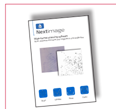
Includes Award Winning Nextimage Software for scanning, copying and printing.