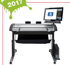
ScanStation Pro - IQ Quattro 3650 - IQ Quattro 3690