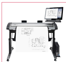
ScanStation Pro - IQ Quattro 4450 - IQ Quattro 4490