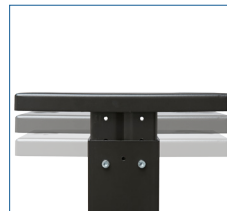
Height adjustable stand for optimal ergonomics