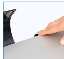
Easily adjust paper pressure to protect fragile documents