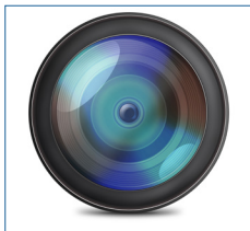
Contex CCD with ALE ensures precision of 0.1% accuracy

HD Ultra scanners are for customers who require a high throughput of documents, great flexibility and unmatched performance.