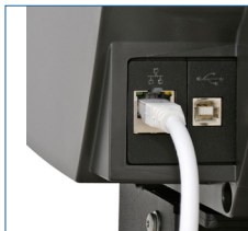
Fastest bandwidth in the industry w/ Gb Ethernet and xDTR2