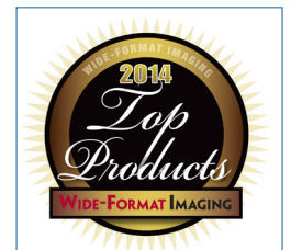
Contex HD Ultra awarded Best Wide Format Scanner for third consecutive year