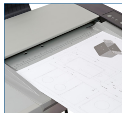
Support your documents with paper feed guides