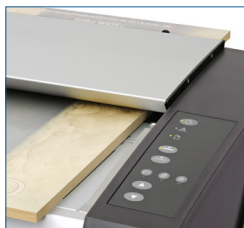
Scan thick originals with automatic thickness control (ATAC)