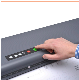
Flexible control panel for easy handling

Scan and document all your architectural, engineering and construction plans in standard file formats directly into your project folders.