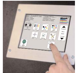
Easy and intuitive 7 inch /17.7 cm color touchscreen front panel