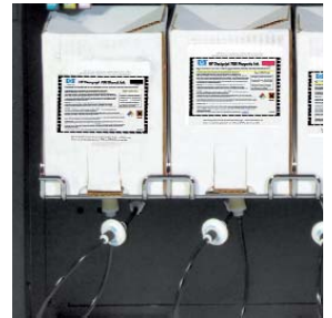
No-drip, quick connect/disconnect HP Designjet 788 inks